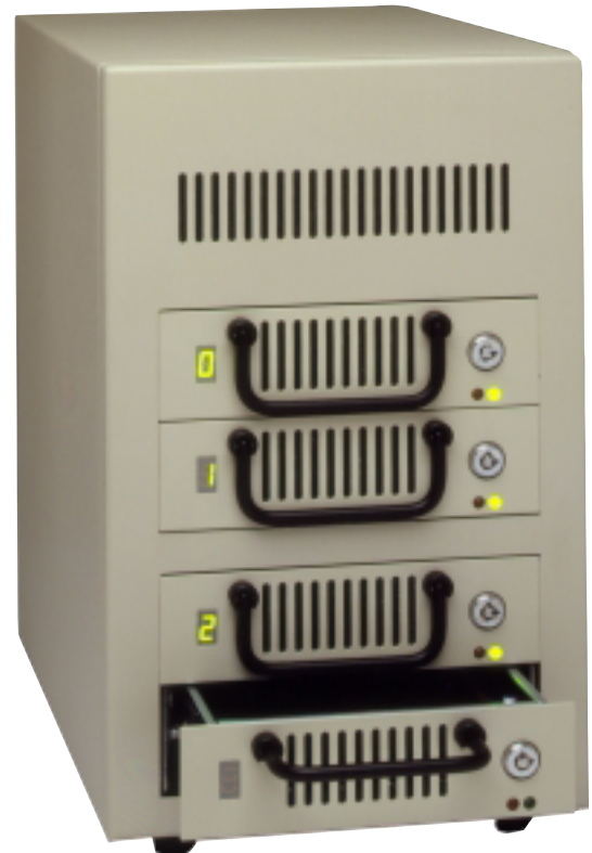
Note: Shown with optional Drive Trays